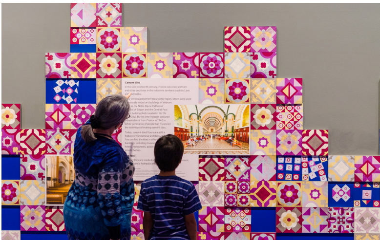
Phuong Ngo Pattern Exchange (installation views, GOMA, 2021) / Commissioned for APT10 Kids with support from the Tim Fairfax Family Foundation

Phuong Ngo is interested in 'history, memory and place, and how they intersect ... to complicate how we understand who we are and how we have come into being'. 5 The artist explores themes of identity and racial stereotypes through colour and pattern, and through the way 'problematic language is used in common places', such as the seemingly innocuous naming of house paint. The space features wall, table and floor graphics that respond to the history of cement tiles as colonial artefacts, with a colour palette drawing on the 'Oriental' colour range offered by a well-known paint brand. Children can create their own collage using a piece of paper in a colour based on the brand's 'true blue' shade and additional swatches of paper selected from the 'Oriental' colours. Ngo hopes that children will 'leave the project with more questions than they came in with ... questioning the language that they use and that is used around them'. 6